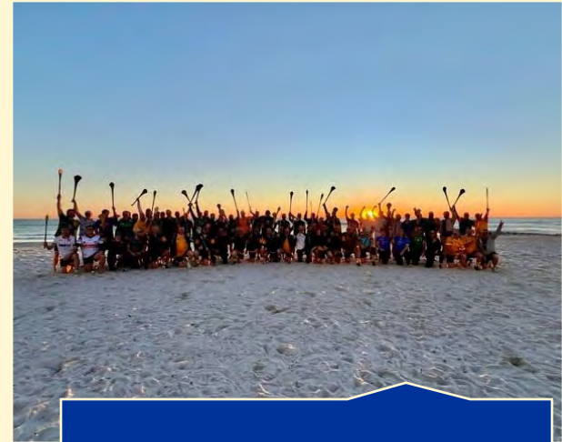
Sun Coast Hurling