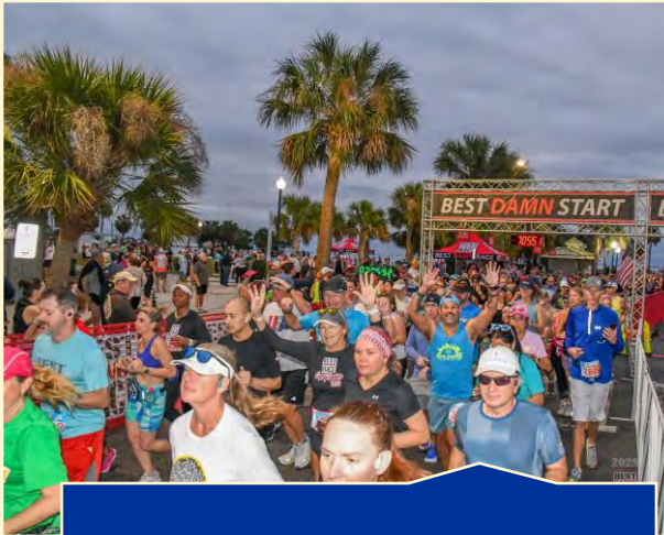
Best Damn Race