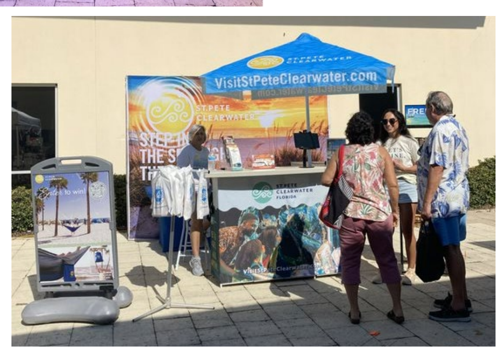
*Engagements include Registrations, Promotional Items, and Destination Magazine Giveaways.